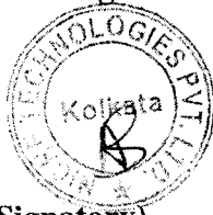
Ashok Sen (Authorised Signatory)